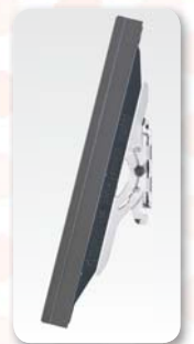
Tilts up to \pm 15^\circ