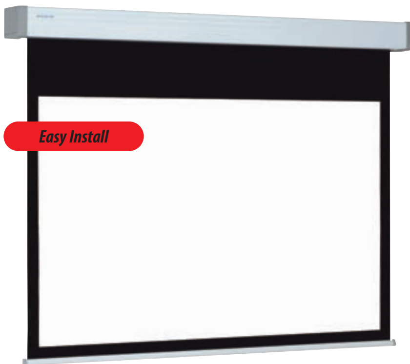
▲ Top quality, electrically operated projection screen with extra black border on top for optimum viewing height.